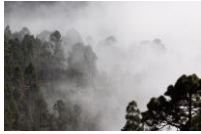
fig fog fgo