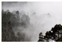
fig fog fgo